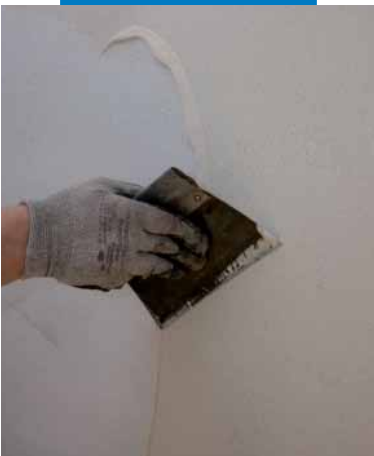
Application of Ultrabond Eco V4 SP Fiber on a wall

harmless to the health of the installer and the end-user. It can be stored with no particular precautions.