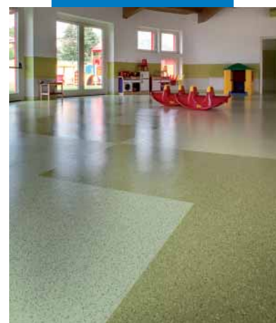
An example of installing rubber flooring in a school: Municipal Infants School, Carobbio degli Angeli (Bergamo)