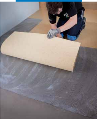
Installation of rubber tiles