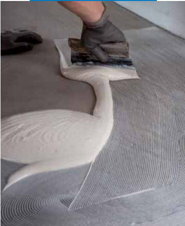
Application of Ultrabond Eco V4 SP Fiber on a substrate