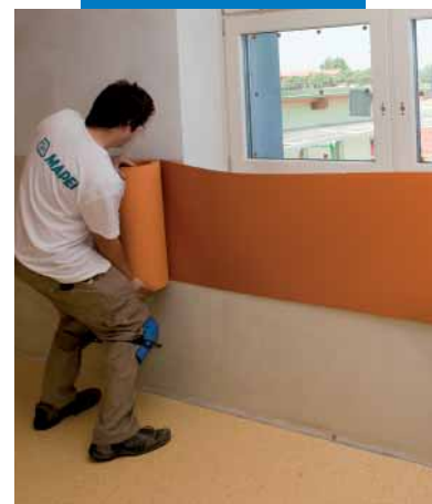
Application of rubber sheeting on a wall