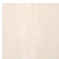
VT951 (450mm square)