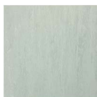
VT954 (450mm square)