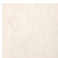
VT955 (450mm square)