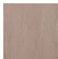
VT957 (450mm square)