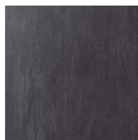
VT958-600 (600mm square)