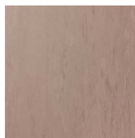
VT957-600 (600mm square)