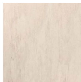
VT956-600 (600mm square)