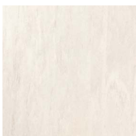
VT955-600 (600mm square)