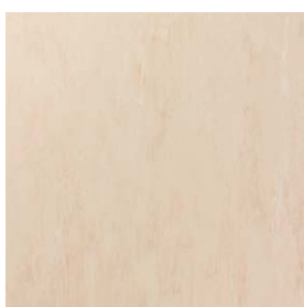
VT952-600 (600mm square)