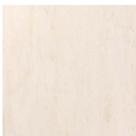
VT951-600 (600mm square)