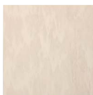
VT956 (450mm square)