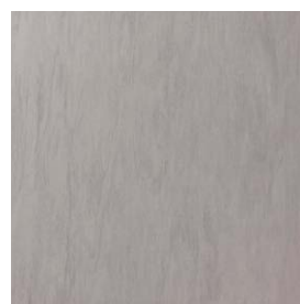
VT959-600 (600mm square)