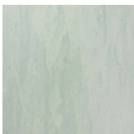
VT954-600 (600mm square)