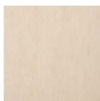
VT952 (450mm square)