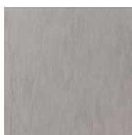
VT959 (450mm square)