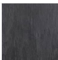
VT958 (450mm square)