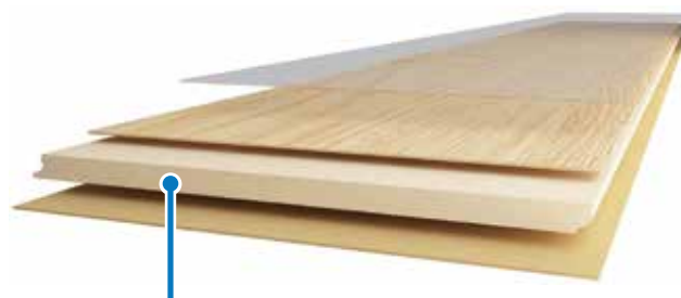
Specialised treatment in the core

Independent test certified for T-Seam - Swell & Seepage > 80hrs.