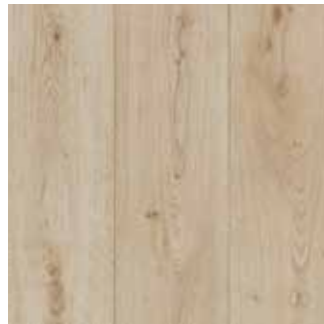
Alpine Mist ●