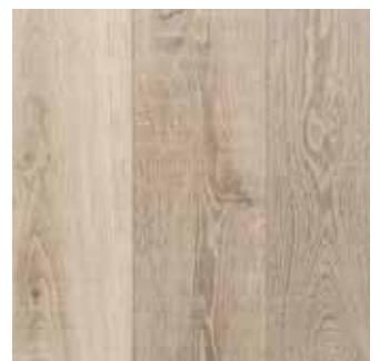
Wolf Grey ●