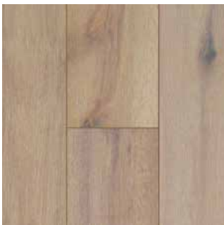
Delta Sand ●