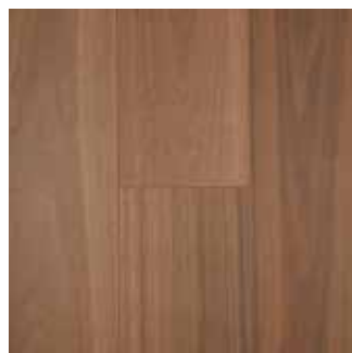
Spotted Gum ●