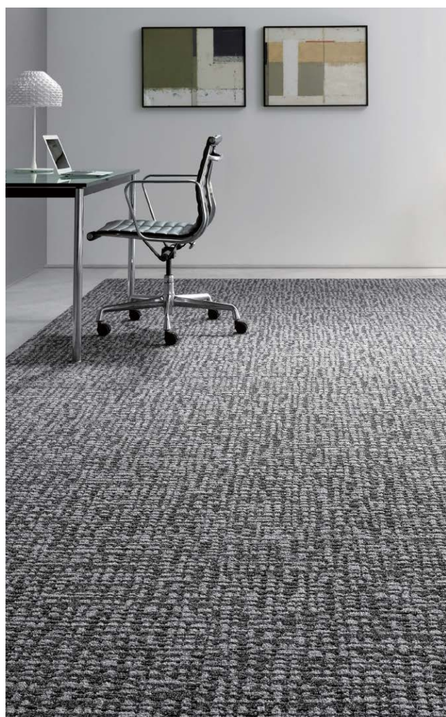
▲ GX4901/TTN3207 (LL FREE 50 NW-EX · page 320)