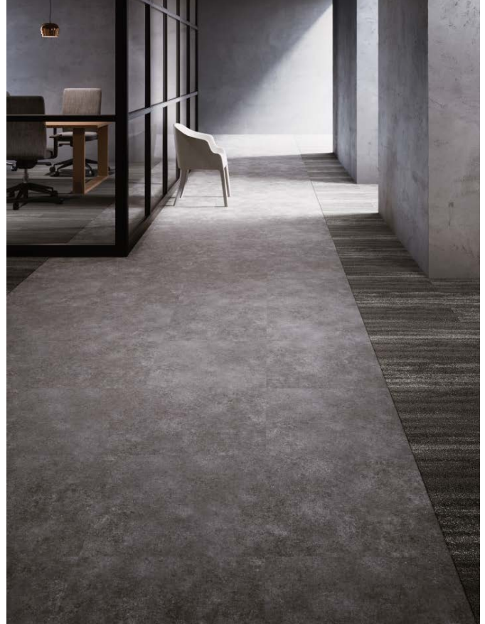
▲ TTN3213/GX9652V (DIFFEBRILLER - page 119)