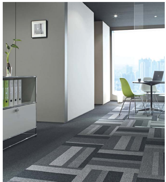
▲ GA4601R/GA4004 (GA-400 · page 78)

GA-400RS can be coordinated with GA-400.